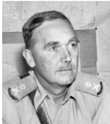
Sir Edmund Herring Queensland, 1944

( https://www.awm.gov.au/collection/C346158 )