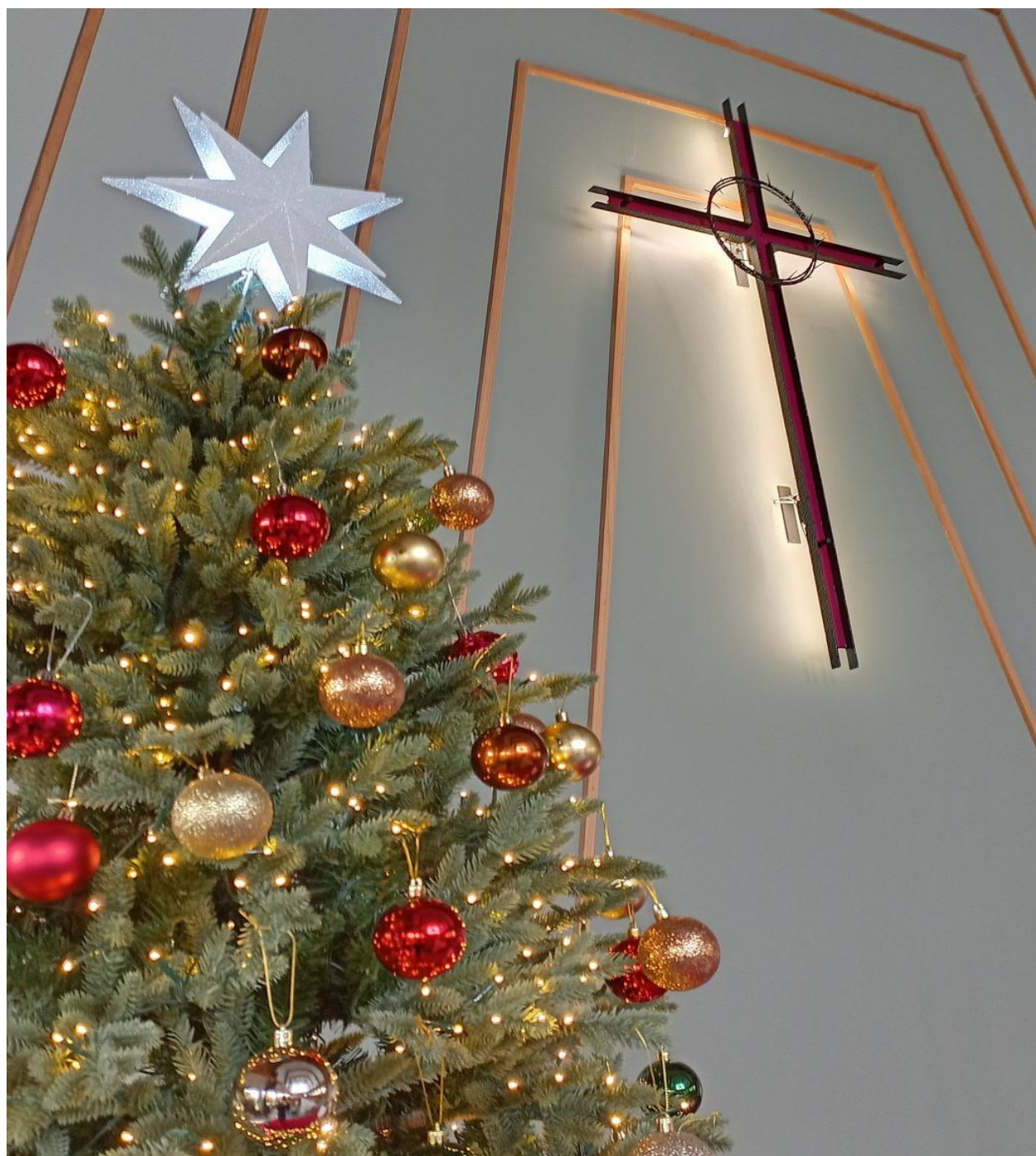
A prominent feature in the church is the cross above the chancel.