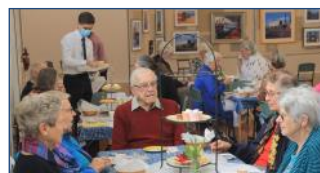
The High Tea event at the art show and sale