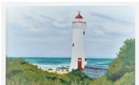
A piece of the art show: Lighthouse - Griffiths Island Port Fairy, by Jill Turpin