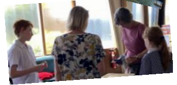
Maths & English tutoring in the Narthex , term 1 - 2020